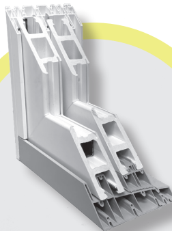
Door Cross Section