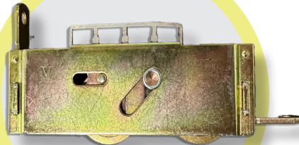
MonoRail Truck built into Door