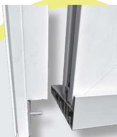
Guide Pin System